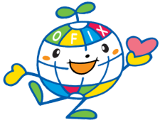
OFIX's Official Character: Bora-chan