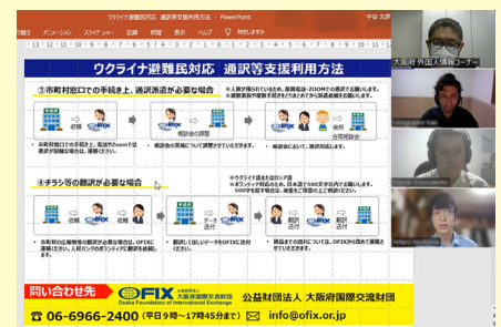
Online meeting for the HR Bank of Interpreters.