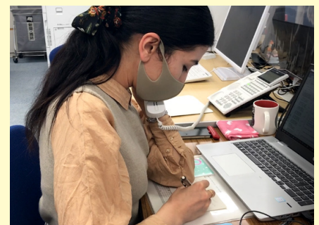
Taking a call from a refugee from Ukraine.