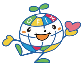
Official Character Bora-chan